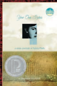
Your Own, Sylvia: A Verse Portrait of Sylvia Plath PB: 978-0-440-23968-0