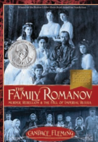
The Family Romanov: Murder, Rebellion, and the Fall of Imperial Russia HC: 978-0-375-86782-8