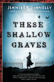
These Shallow Graves PB: 978-0-385-73766-1