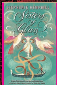
Sisters of Glass PB: 978-0-440-23968-0