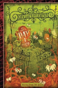
On the Day I Died: Stories from the Grave HC: 978-0-375-86781-1